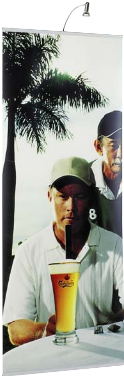
27 9 / 16 " Wide x 70 7 / 8 " High shown with optional spotlight

Metal snap-in clip for EBS profiles allows a graphic to be hung in a window, on a wall or from the ceiling. Sold in quantities of 10 or 100