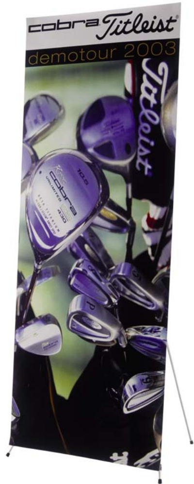
32" Wide x 71" High