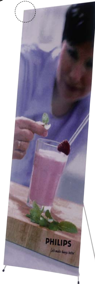
26" Wide x 71" High