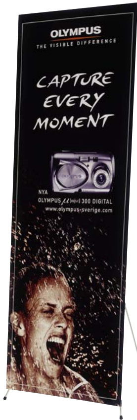
24" Wide x 63" High

This rear view of the EXS with our patented graphic plates, shows how we have eliminated the need for grommets on your panel. Each EXS includes 4 fasteners